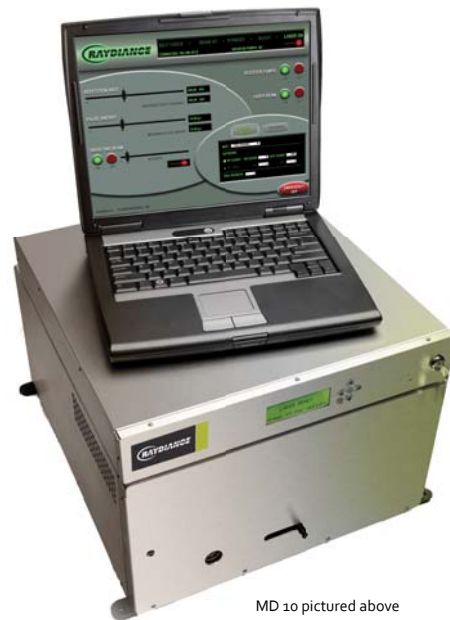
MD 10 pictured above

R aydiance designed and built the world's first and only commercial-grade femtosecond laser. Now, Raydiance brings to the medical micro-devices market the Smart Light MD™ . Fully software controlled and packaged in a compact, ruggedized fiber architecture, the Smart Light MD™ enables truly athermal ablation of any material, from human tissue to the hardest metals. Today, Smart Light MD™ is powering major breakthroughs in the creation of next-generation medical devices for cardiovascular, drug delivery and surgical applications.